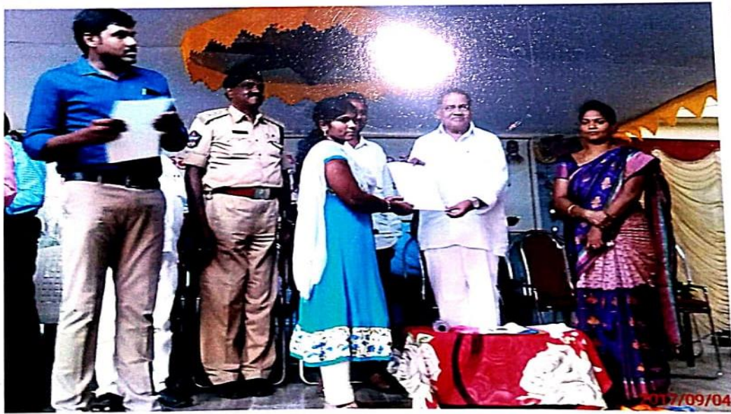
Honorable deputy speaker of A.P give the appointment order to the selected students.