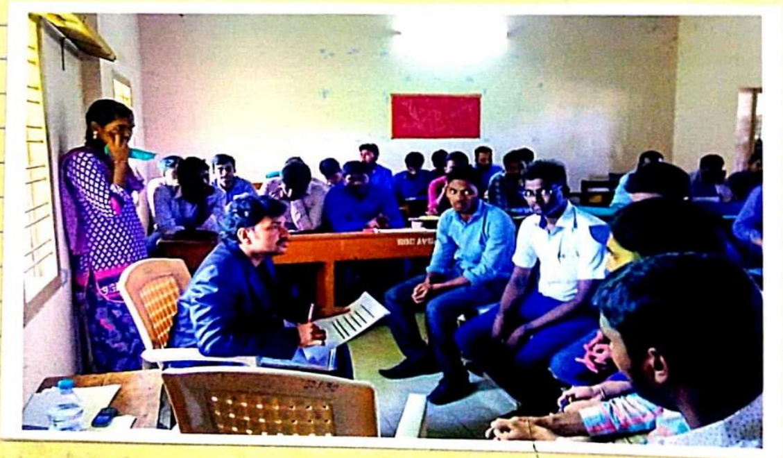
TECH-machindxa company Executive conducting interview