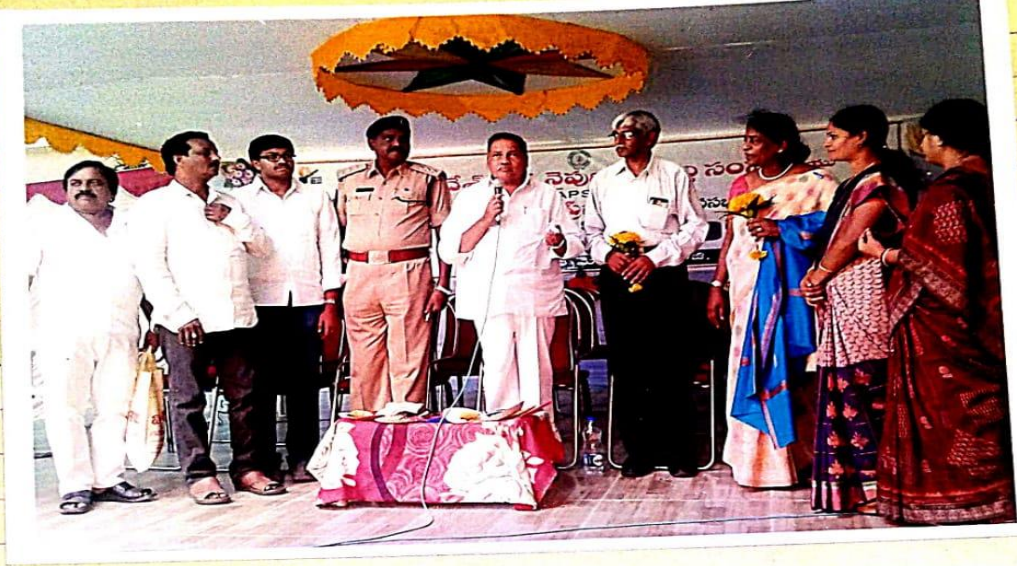
Honorable DUTY speaker addressing about the job mela