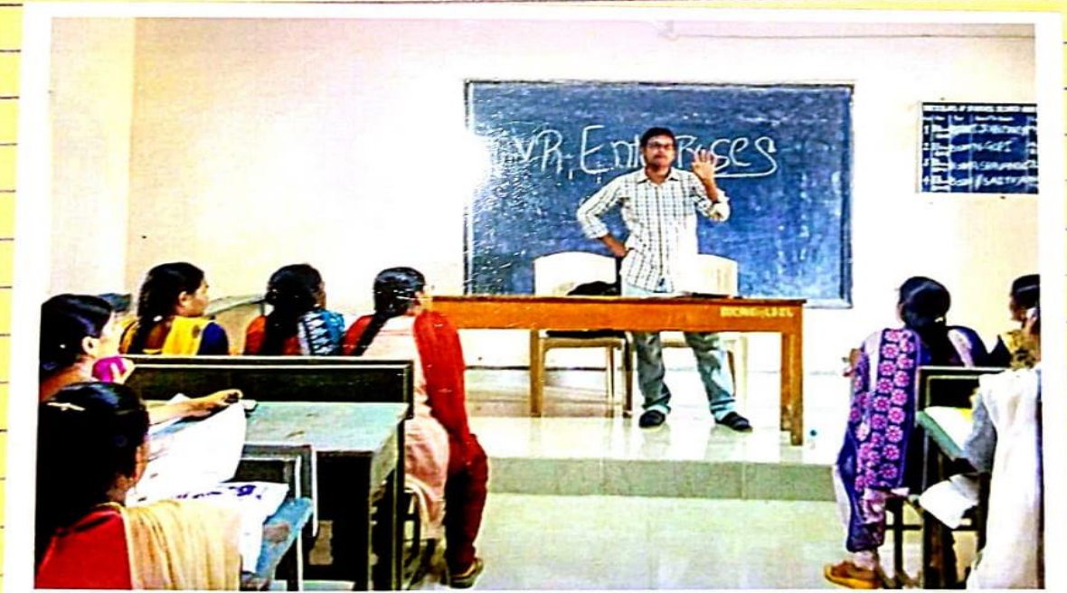
V.R Enterprises Executive Explain about the job meta.