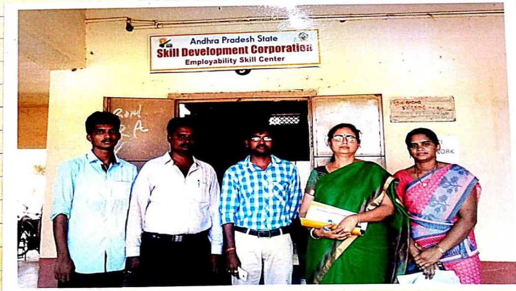
JKC - Coordinator, mentors & along with skat members