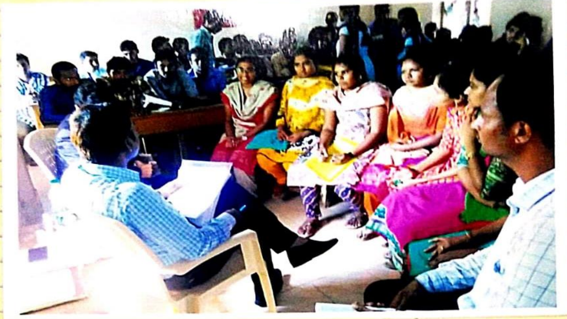
KARVY company Executive conducting interview