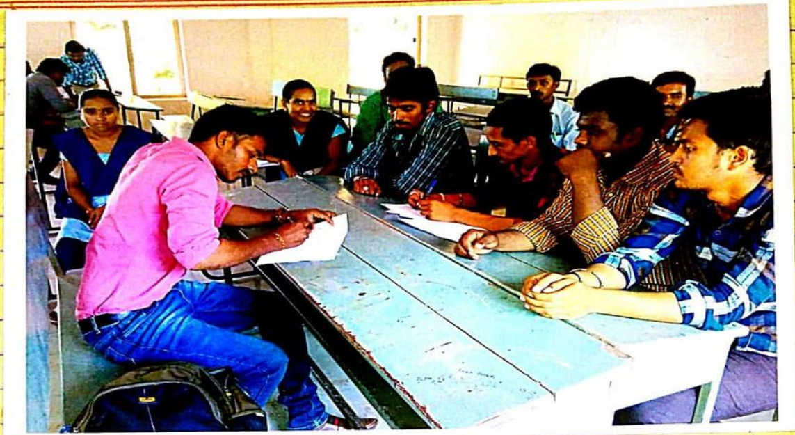
Company Executives collecting information from the participants.