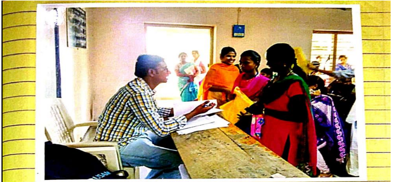
Company Executives conducting interview.